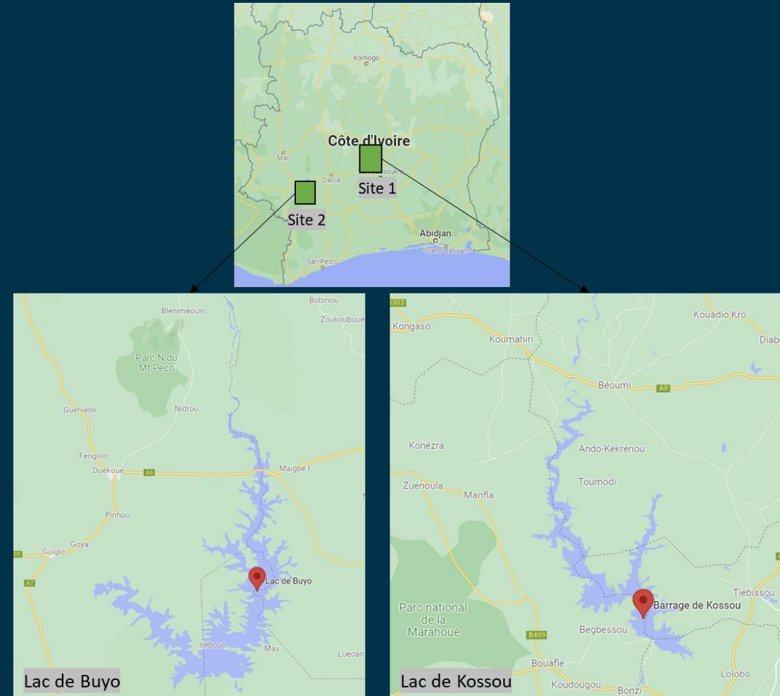
Figure 3 : geographic location of the two lakes (Buyo and Kossou)