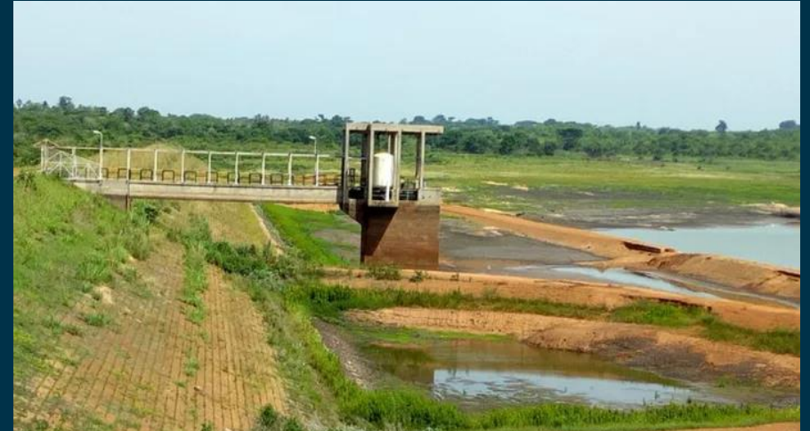
Figure 1 : An almost empty dam near Bouaké (central Côte d'Ivoire).