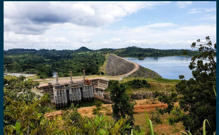
Figure 2 : Decrease of the water level in the lake dam of Kossou